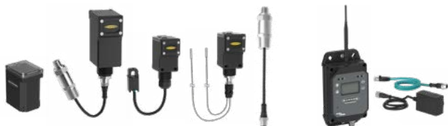
Wireless Nodes and Sensors

DX80N9Q45UPSD, DX80N9Q45DT, DX80N9Q45CT, DX80N9Q45VAC, BWA-PRESSURE-SENSOR-3000