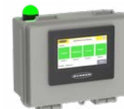
Asset Monitoring Gateway with SNAP ID

S15C-CT150A-MQ, S15C-PS5000A-MQ, S15C-DTMS-MQ, QM30VT2