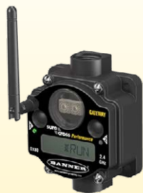
SureCross PM8 Gateway

Improved Performance – Reduced machine down time and greater production output