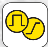
Multiple Signals, Digital and Analogue

Avoid cable damages, cuts or unreliable connections with a wireless communication. Avoid expensive installation time by digging or routing cables with the SureCross solution.