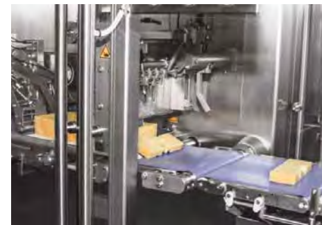
Food and beverage