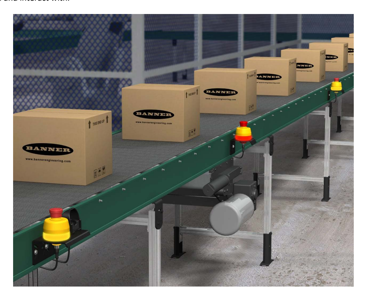
Illuminated emergency stop buttons make it easy to identify a pushed button

Safety devices with integrated visual management can make a significant impact on usability and therefore productivity. Furthermore, operators may also be less likely to attempt to bypass safety measures when the devices are easy to understand and interact with.