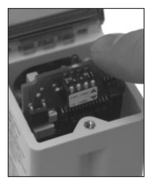
Figure 3. Slide the Q45UML card into the sensor and push it firmly into place.

Transferring Window Limit Settings from the Q45UML to a Sensor Use the following procedure to copy sensing window limit settings stored on a Q45UML card to a Q45U sensor: