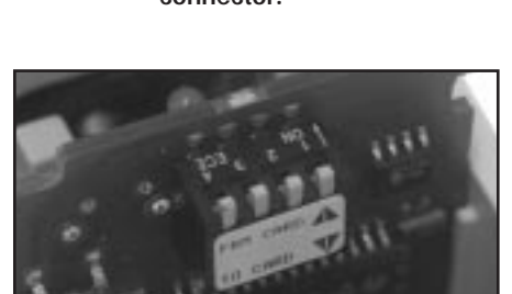
Figure 2. Switch settings