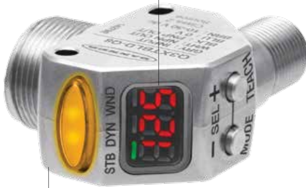
Nicked-Plated Zinc Housing Rated to IP67, IP68, IP69K

Green LED is ON when signal strength is stable