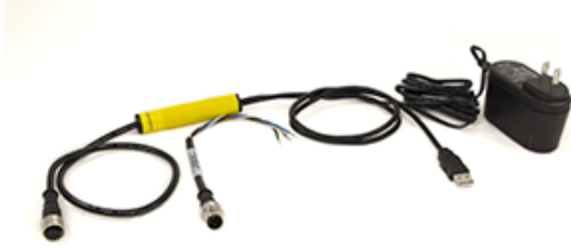
Figure 1. BWA-UCT-900 and MQDMC-401