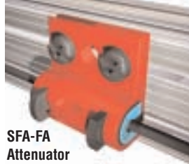
SFA-FA Attenuator (Red Housing)

These fiber optic safety devices are intended to be used with PICO-GUARD series systems in personnel-safety and equipment-protection applications.